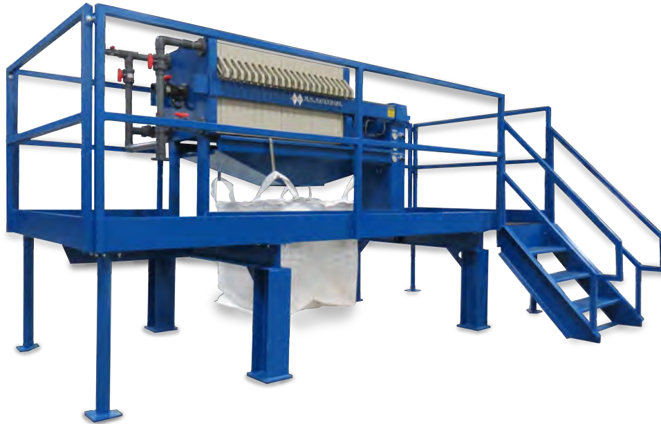
M.W. Watermark 630mm Filter Press with Discharge Chute, Elevated Platform and Bulk Bag

M.W. Watermark offers platforms which serve to raise the press, providing space below for single or multiple containers to receive the filter cake when the filter press is opened and the cake is released. Larger presses can be equipped with an elevated platform that allows roll-off containers to be placed underneath. A "roll-off" platform can be very efficient when managing a large volume of filter cake, as the wheeled bins can be loaded onto a truck relatively quickly for haul-away.