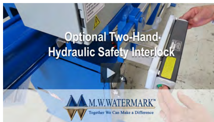
Click to Watch Video

M.W. WATERMARK – Resources For All of Your Water & Wastewater Needs