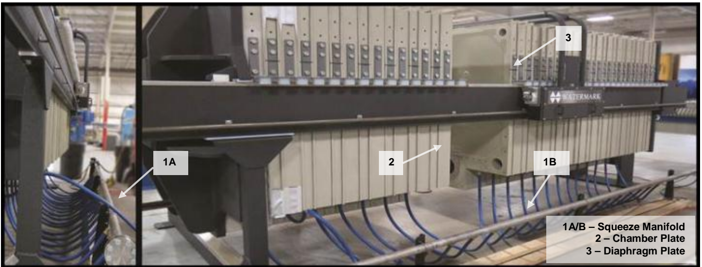
Diaphragm squeeze press with "mixed pack" plate stack.